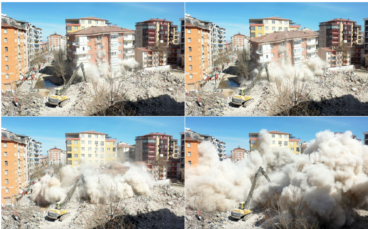
A sequence of images shows workers demolishing a quake-damaged building in Malatya, Turkey, on March 7, 2023. More than a thousand damaged buildings in the region have been demolished since the February 6 earthquake

Prof. Alp also added that structures with flat slabs do not perform well in earthquakes and the same was observed in Turkey earthquake as well. Most of the structures with provision of shear walls to render stiffness were not observed to collapse and the ones which failed were primarily due to the extensive soil displacement. He mentioned that the current standard in Turkey highlights requirement